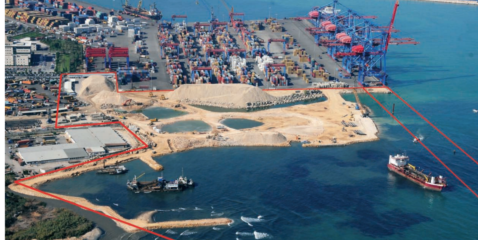
Ongoing dredging and reclamation works for Quay 16 container terminal extension (Nov 2010).