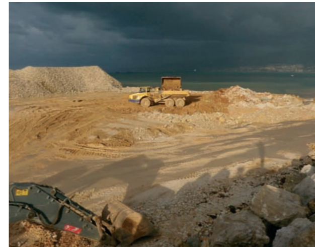
Impression reclamation area.

Due to its central location in Beirut, the only true possible extension of the port is towards the east, which is limited by the existing Beirut River. A seaward extension is not feasible for the presence of the main breakwater as well