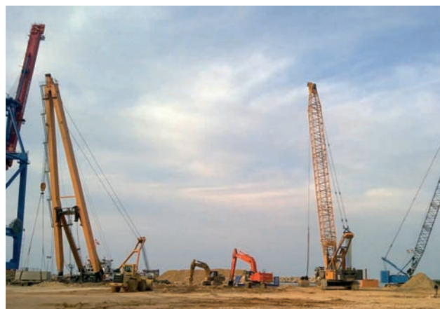
Cranes at work: floating crane, dynamic compaction, piling crane.

Being aware of the need for additional container handling and storage capacity, the Port of Beirut – which is represented by Gestion et d'Exploitation du Port de Beyrouth (GEPB) – launched a tender for consultancy services in 2005 to investigate and prepare for the extension of a short- and medium-term solution for extending container terminal throughput capacities.