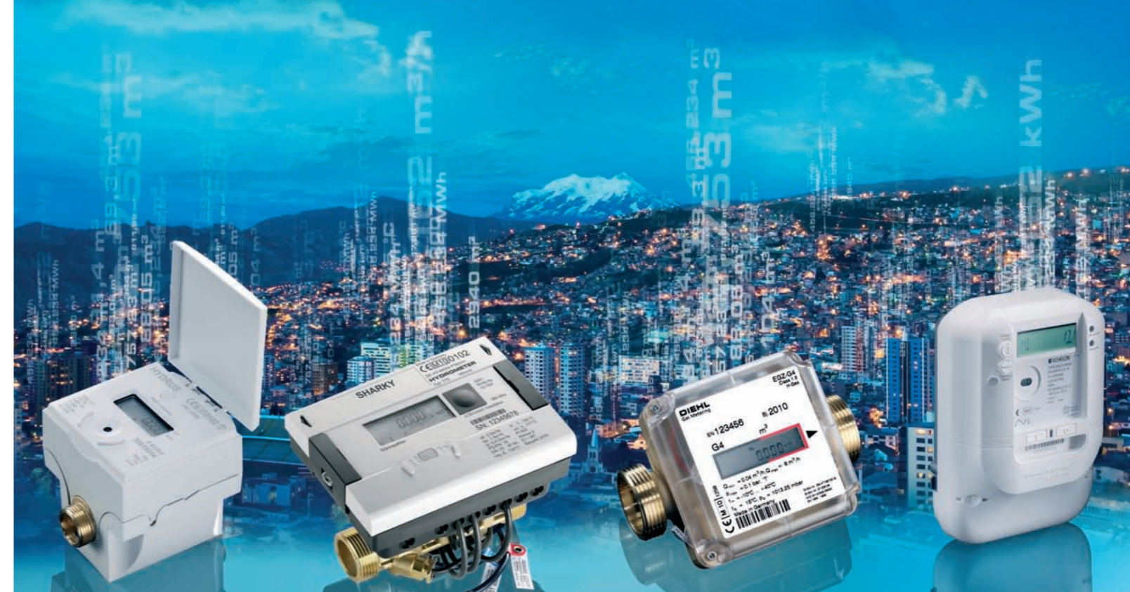
An Integrated Solution for Water, Chilled Water, Heating, Electricity and Gas