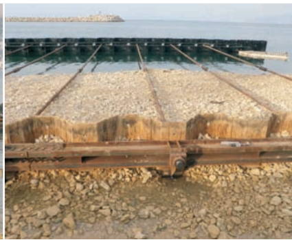
Anchor wall and retaining wall with tie rods before installation of main quay wall (Jan 2011).