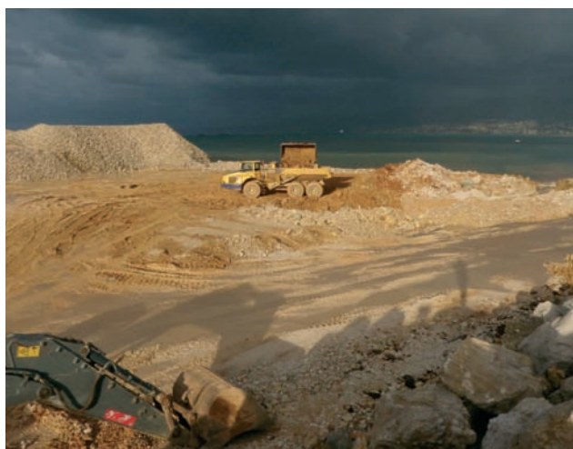
Impression reclamation area.

as for the rapid increase in water depth. Extension within the port's boundaries is also limited because of its already constrained navigational situation. Therefore separate comprehensive studies had to be conducted to derive an appropriate and well-defined design basis; those were: