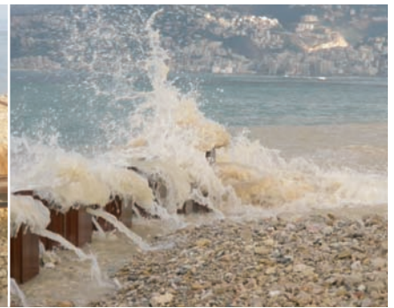
Impression anchor wall.

50 m below sea level, resulting in calculated settlements of 1.5 m within eight years. Since it would not be feasible to replace such quantities with appropriate material, it was opted to accelerate settlements by means of vertical drains and surcharge. Installation of vertical drains from the sea requires special expertise and involves considerable costs. Works are due to start in February 2011. Remaining areas which are not prone for settlements are already reclaimed and construction works for quay walls are ongoing.