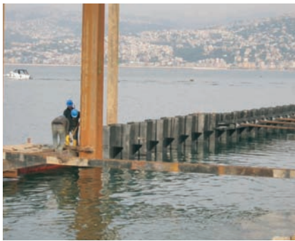
Installation of waling at retaining wall before actual quay wall construction will start.