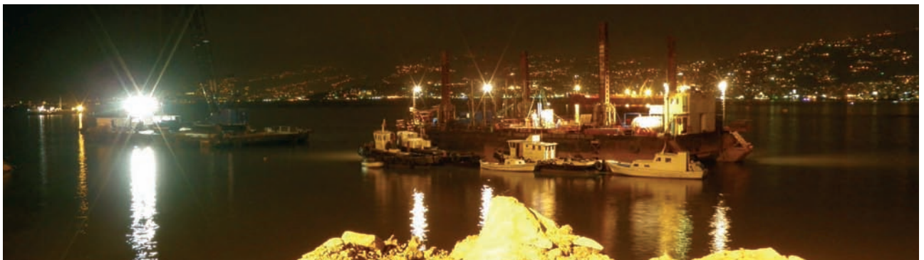
Offshore soil investigation works at night (Oct 2009).

Because Port of Beirut is deemed to serve as an import and export gateway for Lebanon and/or surrounding countries, the hinterland connection of the port remains for the time being an issue which needs to be resolved in the future.