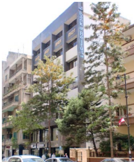
Office in Beirut, Lebanon

Sellhorn Middle East s.a.r.l. Independence Avenue Ascot Building, 5th Floor, Beirut – Ashrafiyeh, Lebanon Phone +961 (0)1 20 35 31, Fax +961 (0)1 20 37 45, mail@sellhorn-me.com, www.sellhorn-me.com